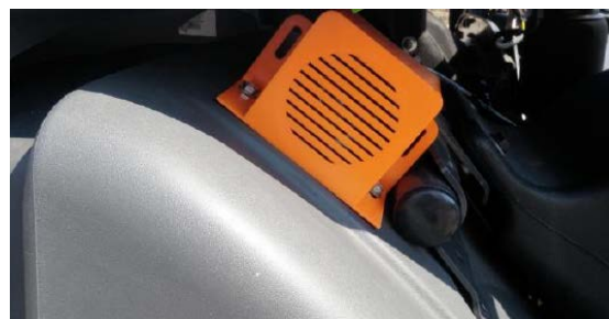
Figure 6: Audible warning system for left-turning