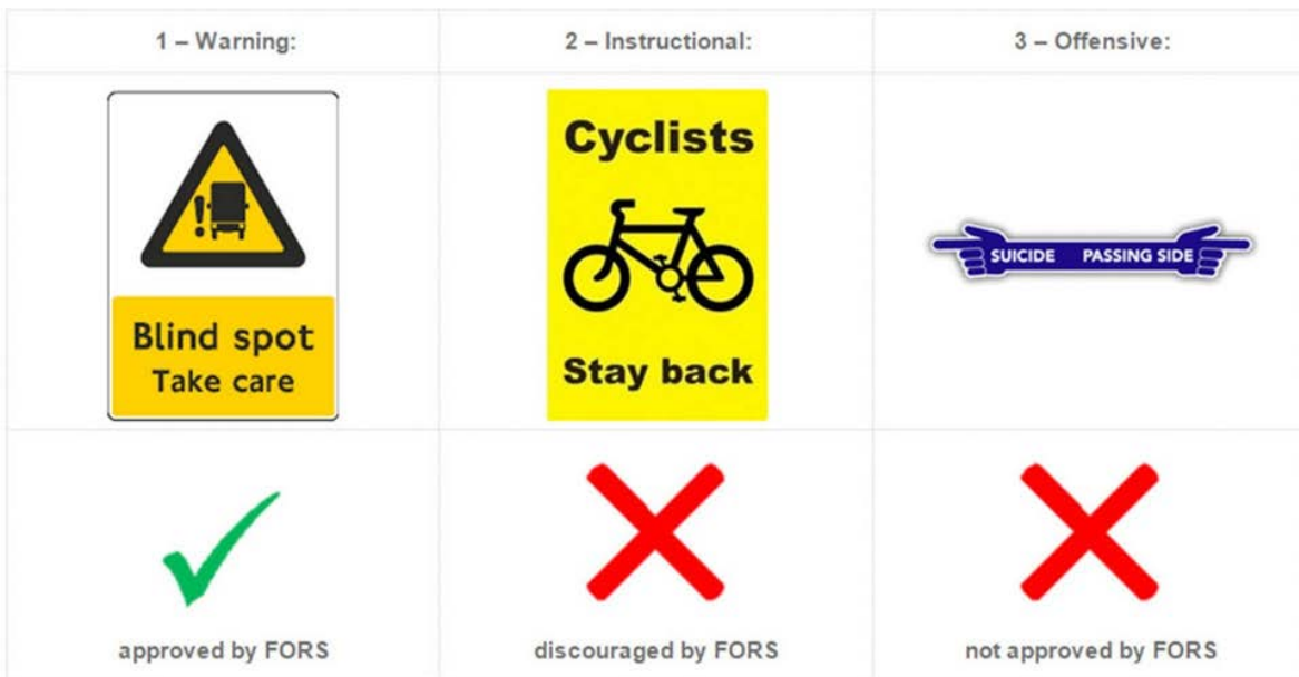
Figure 1: Warning signage guidance

Signage that is considered instructional such as ‘Stay Back’ or ‘No Entry’ is not recommended. FORS guidance is that all existing ‘Cyclists Stay Back’ warning signs should be replaced with the FORS approved signage which has been designed in conjunction with the cycling community. Instructional signage fitted to vehicles will result in a Minor Action Point at FORS audit.