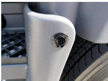
Figure 7: Close proximity sensor

Driver audible alert systems consist of close proximity sensors which detect objects in a vehicle’s blind spot and alert the driver via in-cab audible or visual stimuli. Some systems have been designed to alert the driver when it has assessed the vehicle to be on a collision path with another road user.