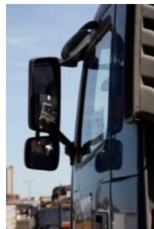
Figure 4: Class V mirrors

Forward control vehicles are defined as having the steering wheel in the first quarter of the vehicles length (vehicle only, not vehicle and