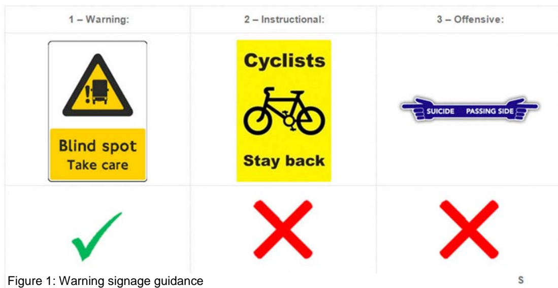
Figure 1: Warning signage guidance

Warning signage shall be A4 or equivalent size unless this is not