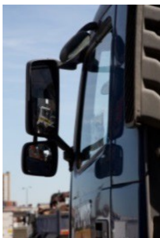
Figure 4: Class V mirrors

Class V mirrors are a legal requirement on non-exempt vehicles and shall be retrofitted, when required, on existing HGVs in order to meet the FORS requirement. A Class V mirror may also be retrofitted to the driver's side.