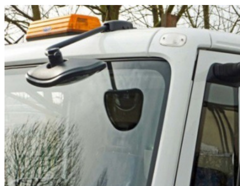
Figure 5: Class VI mirrors

Class VI mirrors are a legal requirement on all new vehicles over 7.5 tonnes gross vehicle weight and must be retrofitted on existing vehicles.