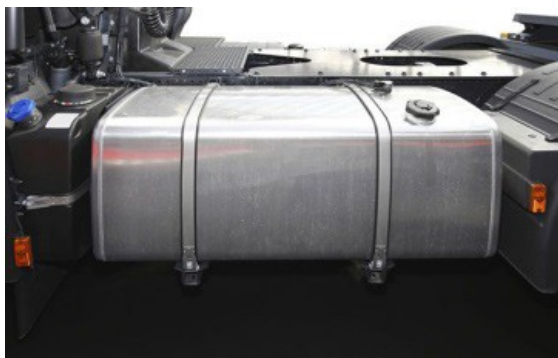
Figure 3: Example of fuel tank achieving the same objective as sideguards

Once fitted, you shall ensure that sideguards are kept in a serviceable condition. A vehicle exempt from sideguards under the Safer Lorry Scheme Traffic Regulation Order but which has them fitted can still fail its annual test if the sideguard or bracket is insecure; has exposed surfaces which are not smooth (e.g. it has jagged edges or bolt heads that are not domed shape); or increases the overall width of the vehicle.