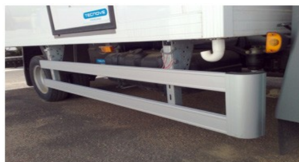
Figure 2: Side under-run protection

achieved by the fitment of sideguards, ancillary devices (fuel tank, locker box etc.) and/or vehicle design.