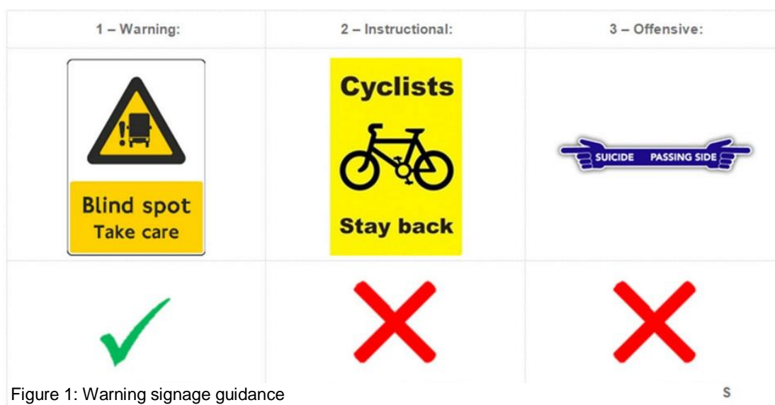
Figure 1: Warning signage guidance

Warning signage shall be A4 or equivalent size unless this is not