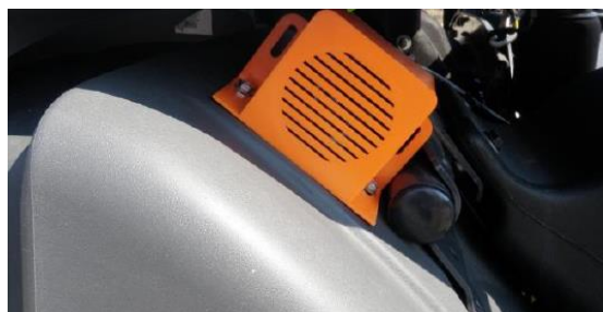
Figure 6: Vehicle manoeuvring warning for left-turning