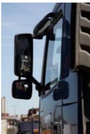
Figure 4: Class V mirrors

Class V mirrors are a legal requirement on non-exempt vehicles and shall be retrofitted, when required, on existing HGVs in order to meet the FORS requirement. A Class V mirror may also be retrofitted to the driver's side.