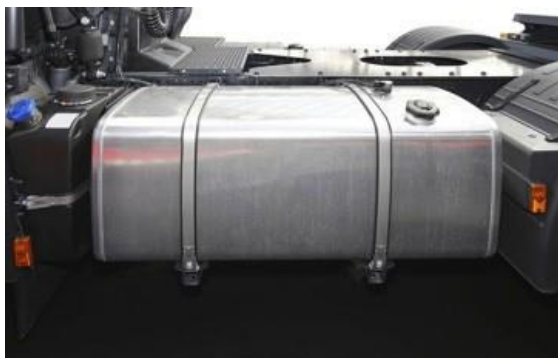
Figure 3: Example of fuel tank achieving the same objective as sideguards

Once fitted, you shall ensure that sideguards are kept in a serviceable condition. A vehicle exempt from sideguards under the Safer Lorry Scheme Traffic Regulation Order but which has them fitted can still fail its annual test if the sideguard or bracket is insecure; has exposed surfaces which are not smooth (e.g. it has jagged edges or bolt heads that are not domed shape); or increases the overall width of the vehicle.