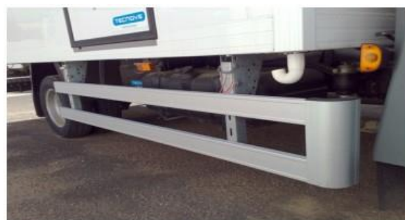
Figure 2: Side under-run protection

achieved by the fitment of sideguards, ancillary devices (fuel tank, locker box etc.) and/or vehicle design.